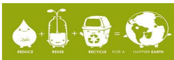
Figure 2: Reduction, Reuse & Recycle

On the other end some of the industries also work on their manufacturing process, selection of raw materials for example they use alternative substance for coating capsule or tablets, uses non toxic dyes and coloring agent by this they decrees toxic effects of pharmaceutical production on environment.